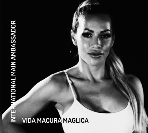
INTERNATIONAL MAIN AMBASSADOR